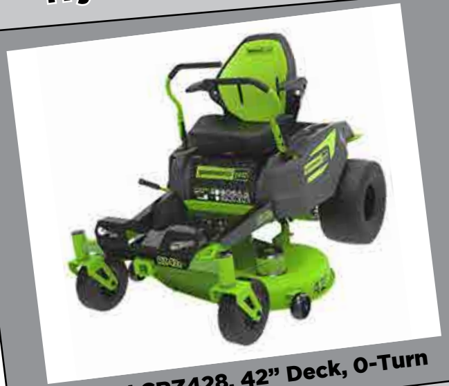
Model CRZ428, 42" Deck, 0-Turn

Cuts up to 2 acres per charge, includes six 5.0AH Batteries & Chargers