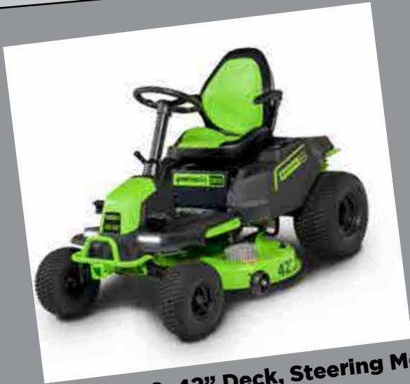
Model CRT428, 42" Deck, Steering Model

82V BATTERY POWERED RIDE-ONS AT AFFORDABLE PRICES Try a test drive today!