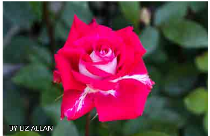
BY LIZ ALLAN