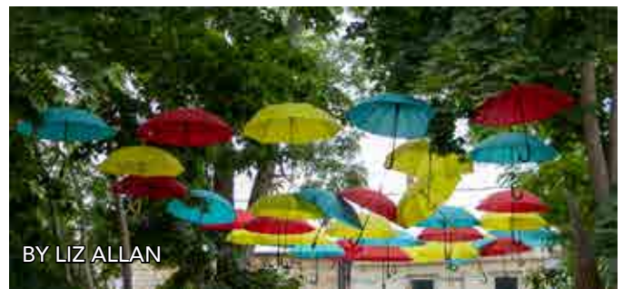
BY LIZ ALLAN