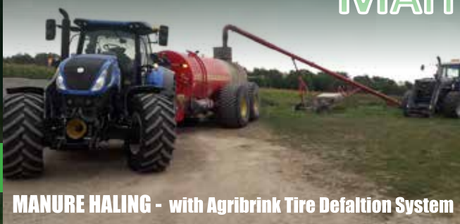
MANURE HALING - with Agribrink Tire Defaltion System